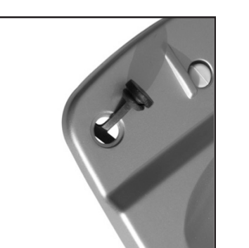
Plug, Water Outlet